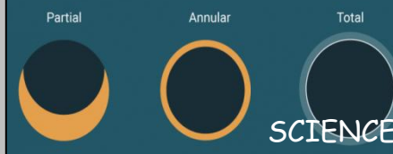
Types of Solar Eclipses